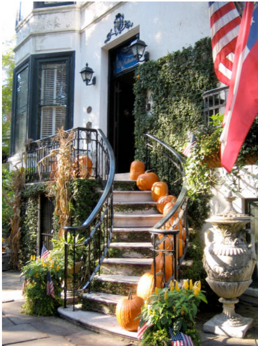
50 th Street

The 61st St. pump station and out flow system is completed and just a few clean up issues need to be resolved. By the time this newsletter arrives it should all be cleaned up and the temporary trailer removed. The pumping system appears to be working as expected. A big thanks to Ron Pearson for keeping us abreast throughout the entire project. He will have a final update at the next meeting. Let's hope we don't need to test it to its maximum performance anytime soon. Still some time left in hurricane season, so let's hope we are spared once again.