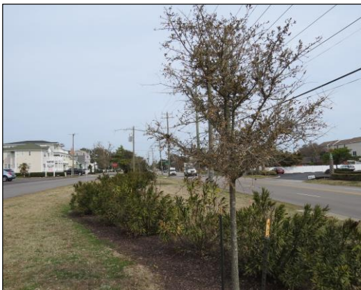
The goal was to plant trees in the Atlantic median so each block totals five live oaks, both new and established.

Lots going on in the North End, particularly with the thawing temps. You will perhaps notice our new live oaks have been planted up and down the median flower beds where needed (photo). Special thanks to Jim Spruance for working with the city to get this accomplished. In the very near future, the new bus shelters will appear at 57th and 67th streets, and I think everyone will appreciate their appearance and the service they will offer to all who use the bus system. Again, thanks to Dave Jester,