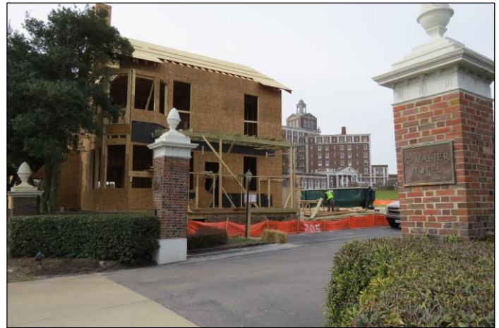
The first residential construction at the Cavalier on the Hill site is this model house, on Lot 26, photographed in late March.

■ The Cavalier project continues in design, and the historic hotel continues under renovation while the beachfront hotel is being demolished. The project is reportedly well under way, and a model house is under construction on the northeast corner of the