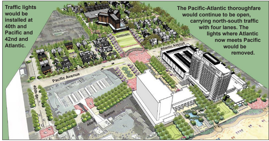
RENDERINGS COURTESY OF GOLD KEY | PHR