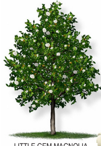
LITTLE GEM MAGNOLIA