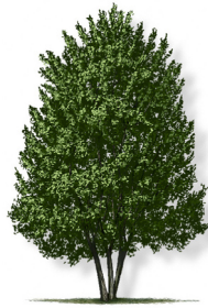
SWEET BAY MAGNOLIA