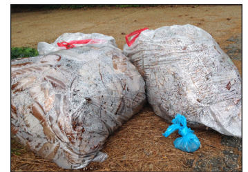
DON NADEN / NVBCL

Yes, people say they sometimes leave a bag intending to