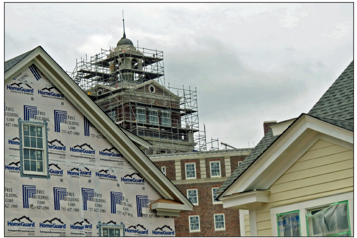
DON NADEN / NVBCL

The Cavalier The grand hotel on the hill and surrounding residences continue to be well under renovation and construction. Several recent initiatives involving the proposed realignment of Atlantic Avenue are in the works. For overall information on the project: www.cavalierhotel.com . Also, the city website www.vbgov.com/government/departments/sga/projects offers information on other resort projects.