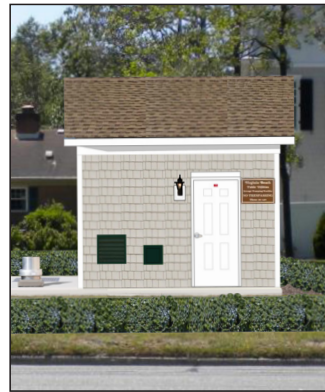
This is a possible design for the replacement station.

bender reports are available soon, those involving personal injury take longer – so he did not have it in time for me to include any more information in this article. The intersection has traffic signals and walk lights as well as pedestrian-crossing signs.