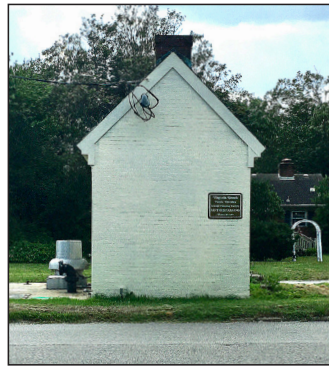
This is the existing 48th Street sewage pumping station today.

I spoke to the city's traffic engineer involved in that investigation who said that while fender-