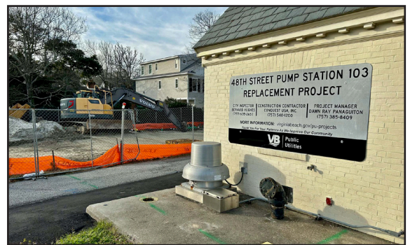
DON NADEN | NVBCL

The project began Aug. 21 and was expected to take 15 months, three months shorter than originally esti-