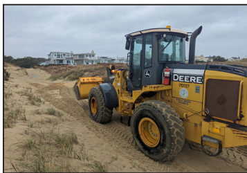
CITY OF VIRGINIA BEACH

Among the Beach Operation team's many responsibilities is grading and otherwise moving vast amounts of sand around.