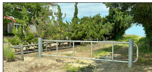
Three city service-access gates – this one at 68th Street – have been replaced at the city's beach-access entrances.

The sand replenishment project at the south end of the beach has been postponed until a new plan is approved. When the dredging began the sand was found to be unacceptable – it was like clay. The operation has moved south of Rudee Inlet for Croatan's residents to enjoy for the summer.